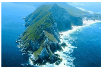
Cape of Good Hope