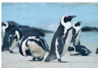
Penguins – Boulders Beach